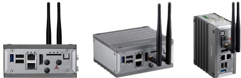
■ MXE-200/200i with Antenna