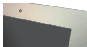
Aluminum front bezel