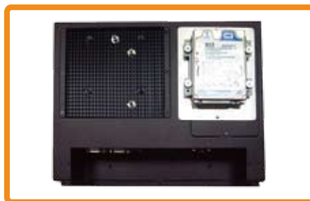
■ HDD Anti-Vibration Easy-install kit