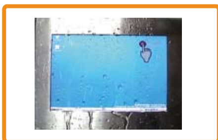
■ IP65 in Front & Side Frame