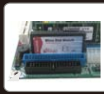
Option Industrial MDM