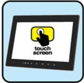
[ GFC Series ]