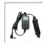
Car power cord