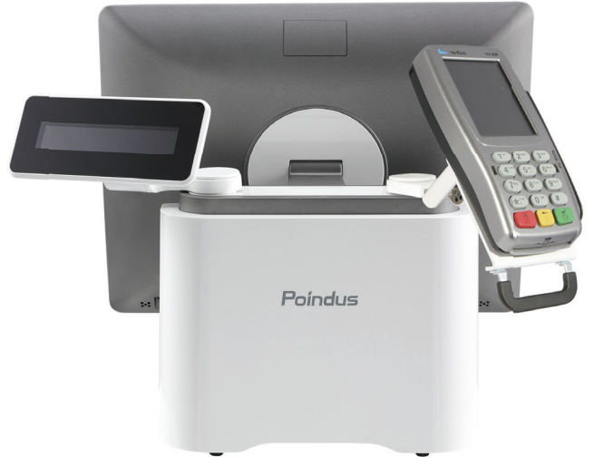
LCM / Pin Pad Bracket (Left / Right Base Mounting Points)