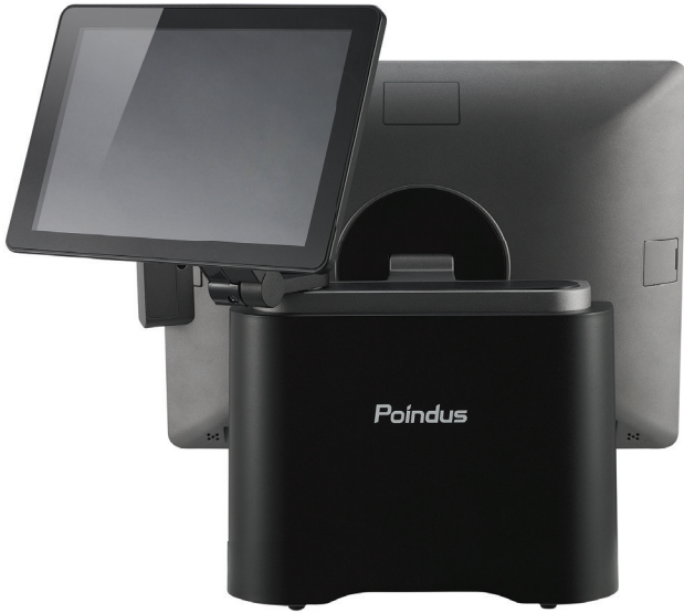
2 nd Display