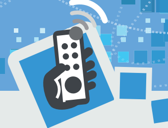
IR Remote Control (Optional)

To detect HDMI connection status between player and screen when black screen occurs.