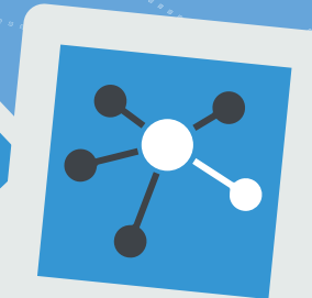
HDMI Signal Detection

To record permanent data and information such as version, build date/location, project name and maintenance record in player for easy management.