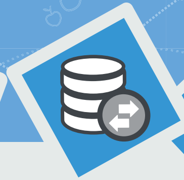
System Data Record

To read the EDID data of consumer screen to meet the advanced requirements of digital signage establishment, so that to ensure player can support the display perfectly to avoid black screen situation.