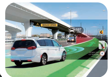
^ In-vehicle Computing