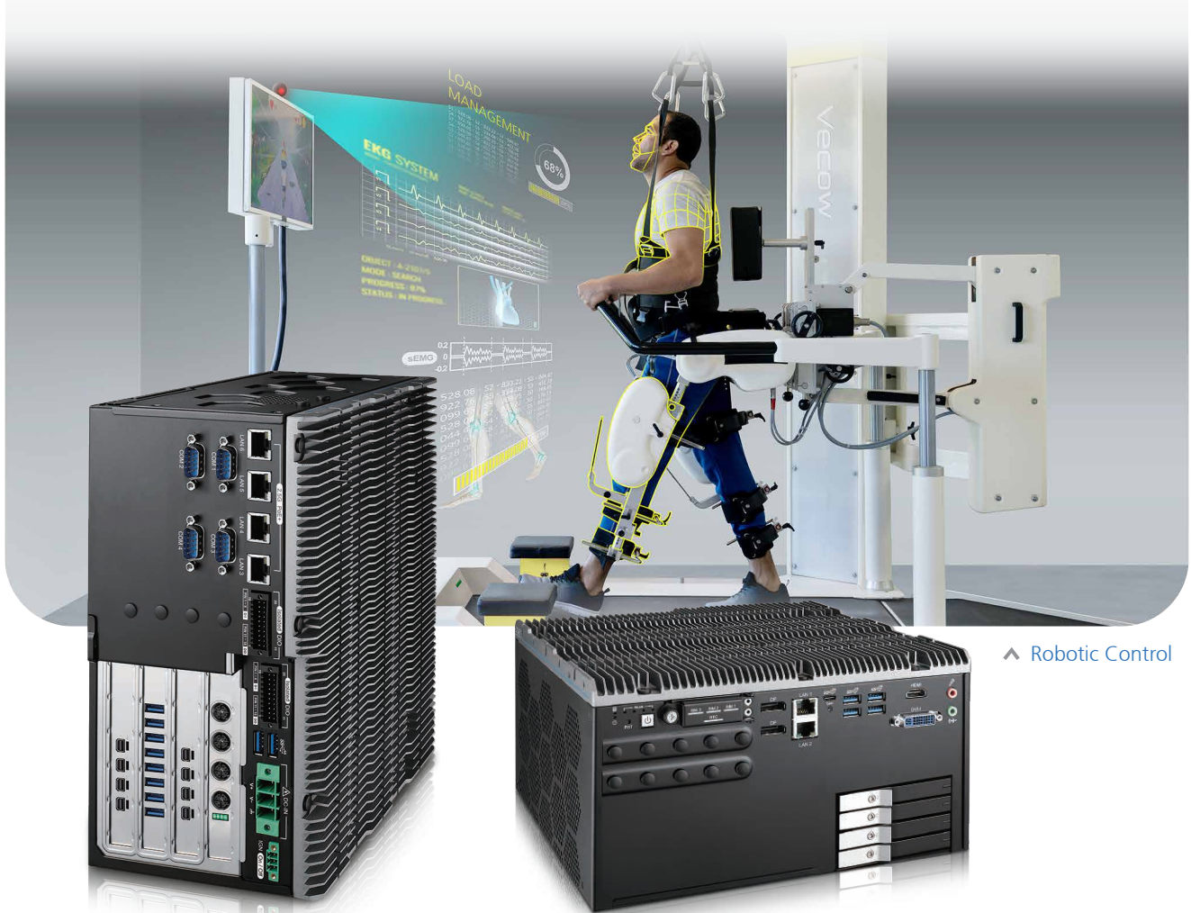
^ Robotic Control

13th/12th Gen Intel® Core™ i9/i7/i5/i3 Processor (Raptor Lake/Alder Lake) Flexible AI Inference Workstation