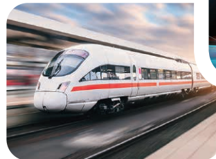
▼ Rolling Stock