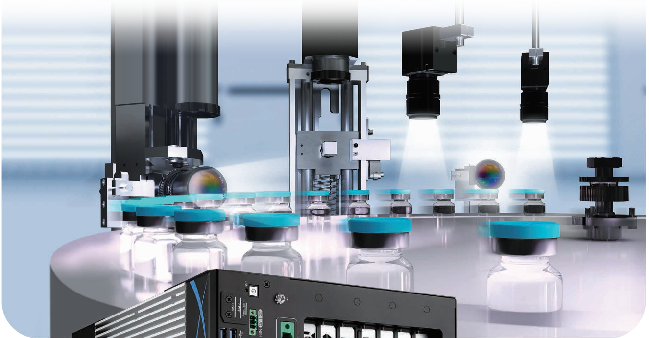
▲ High-Speed AOI

AI Computing System with NVIDIA® Tesla®/Quadro®/GeForce®/AMD Radeon™ Graphics